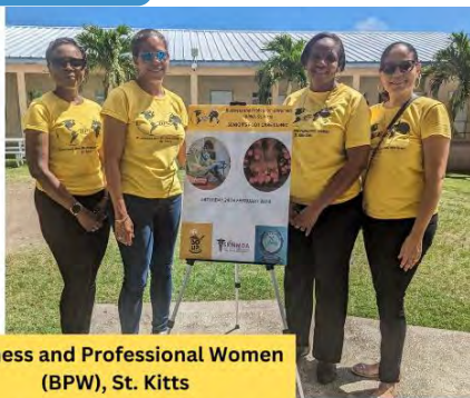
Business and Professional Women (BPW), St. Kitts SENIOR'S FOOT CARE CLINIC